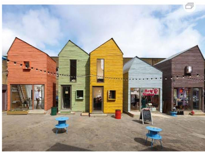
Turning the old car park into a 'place' for the short term, Jan Kattein Architects didn't redo the serviceable surfaces at the centre of Blue House Yard.

Then came the big gesture – the plain 80s offices were painted blue; blue brick, blue roof, blue gutters, blue doors. People started to sit up and notice something unusual was going on. As fashion shoots showed up and sandwich-chain Subway shot a video alongside, Wood Green appeared to be getting a new sort of attention.