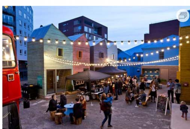
Blue House Yard