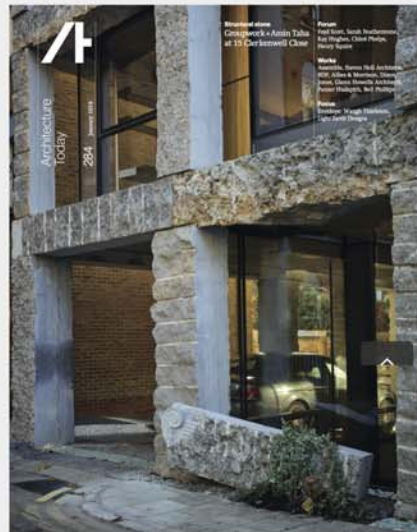
VIEW THE DIGITAL EDITION