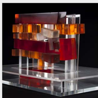
'Zaha Hadid Architects: Evolution' at Arts University Bournemouth