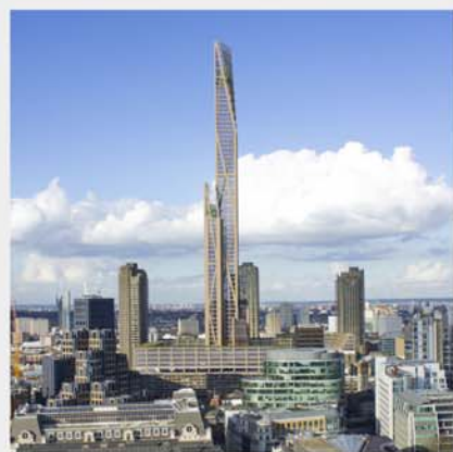
'Timber Rising' at Roca London Gallery - building tall in wood