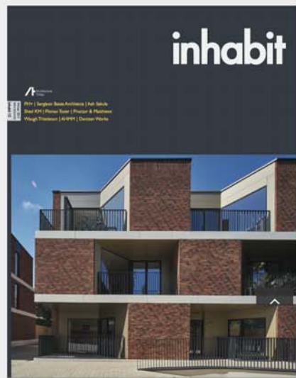
VIEW THE DIGITAL EDITION