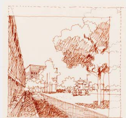
'Off Location' - Carlos Diniz's drawings of the US embassy in Moscow on show at Pushkin House