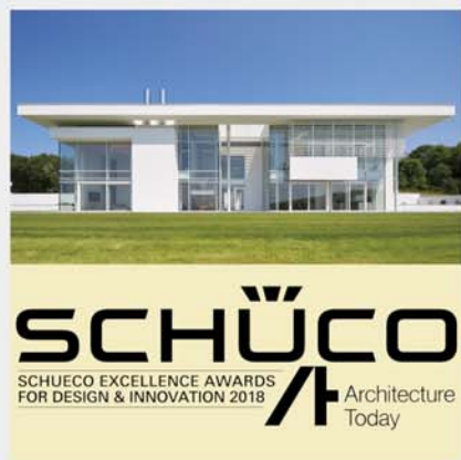
Entries are open for the 2018 Schueco Excellence Awards for Design and Innovation