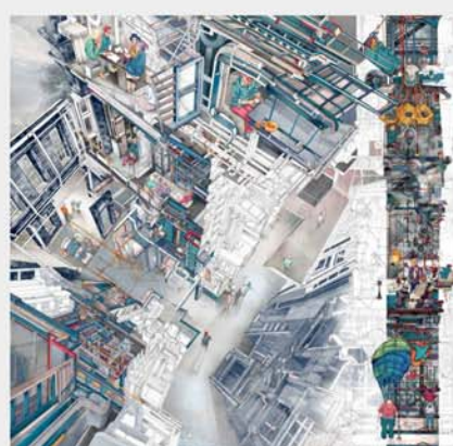
'Architecture Drawing Prize': winning and shortlisted entries at Sir John Soane's Museum