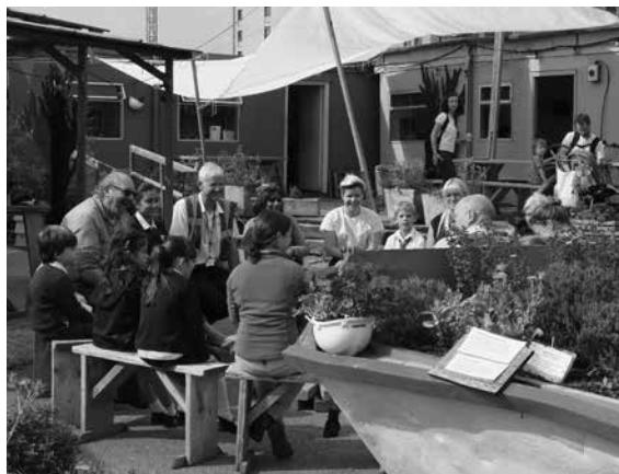
1 Lunch and Learning at the Skip Garden provides an opportunity for people from all walks of life to work on a common task and learn from each other.

Great effort went into establishing a mutually beneficial working relationship. That way, risks and opportunities became a shared concern between the partners. The role of Global Generation was to act as an inquisitive client who would provide a site for the realisation of a series of full-scale built structures, but who would also help to shape the students' brief