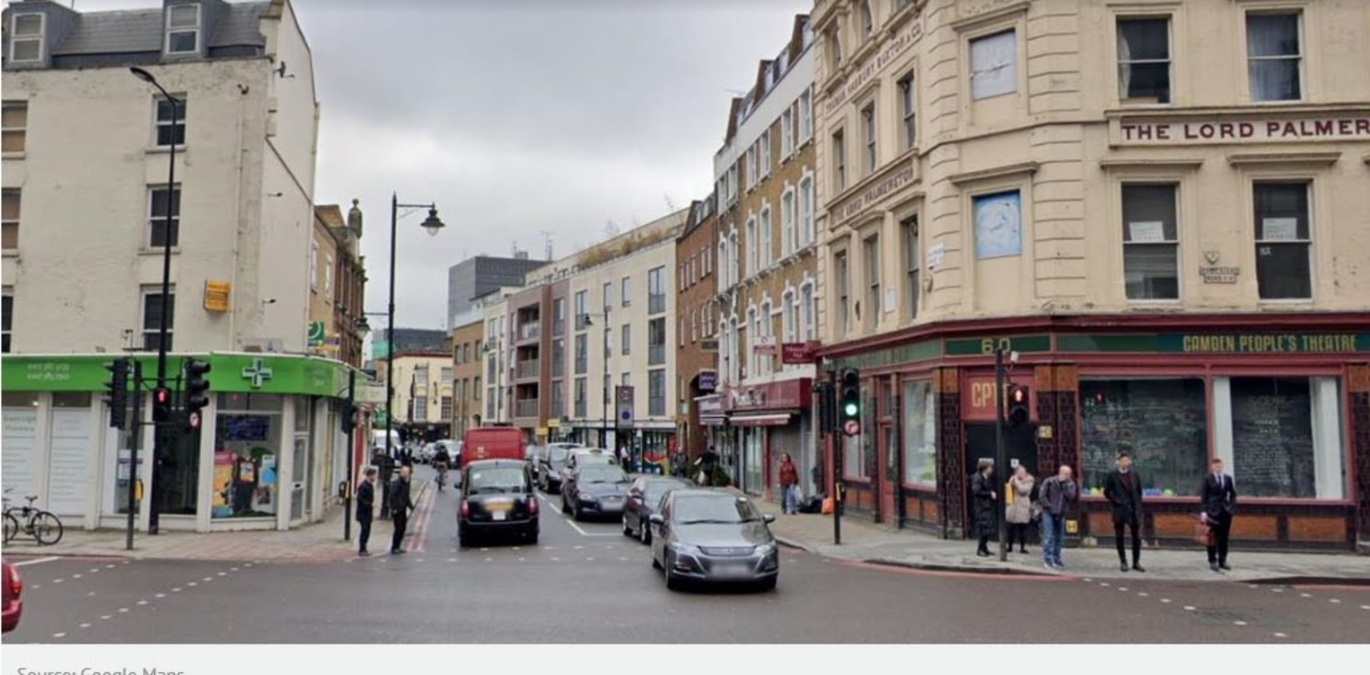
Drummond Street, seen from Hampstead Road