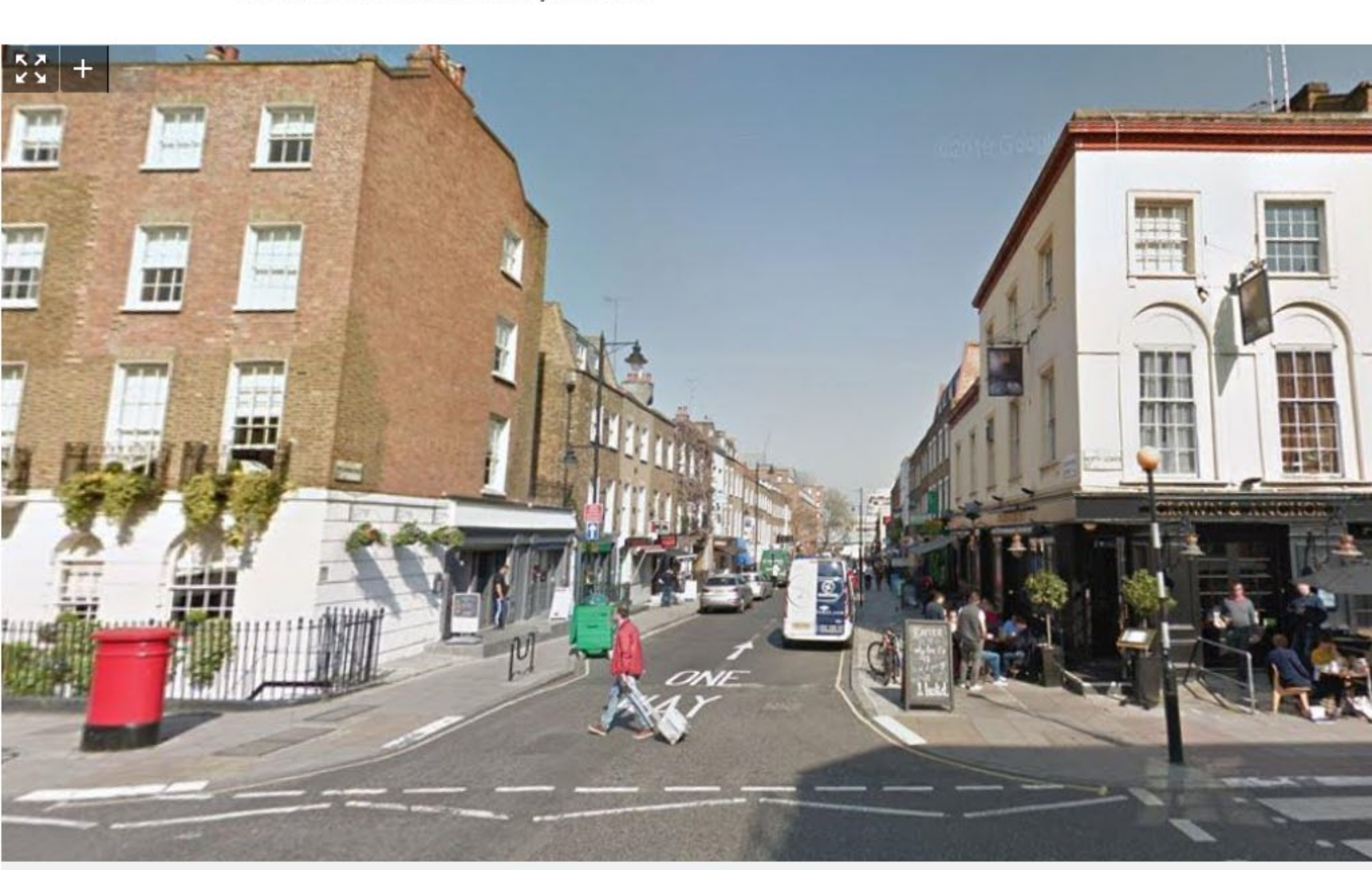
Drummond Street, seen from North Gower Street

"We are working to preserve a unique cluster of independent businesses, and hand back control to the local community," she said.